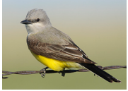
Western Kingbird has arrived!