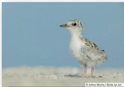
Least Tern Chick

Black Skimmer -- The large red and black bill is knife-thin and the lower mandible is longer than the upper. The bird drags the lower bill through the water as it flies along, hoping to catch small fish.