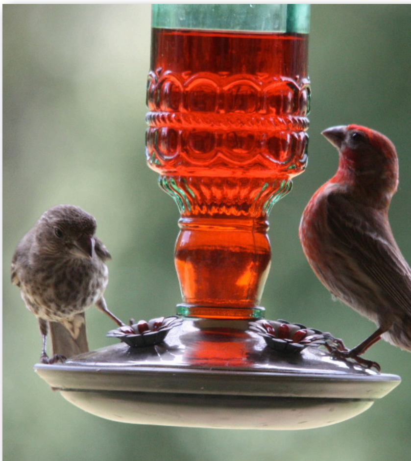
What does that Hummer know that we don't?