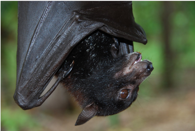
Australian Fruit Bat