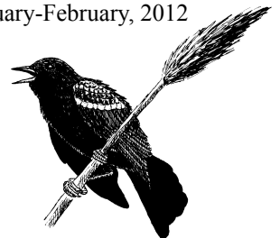
Red-winged Blackbird