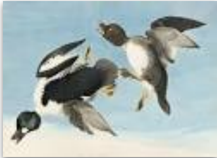
James J. Audubon's painting of Common Goldeneye Duck, male & female