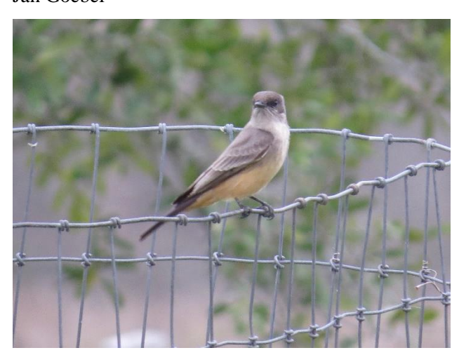
A SAY'S PHOEBE