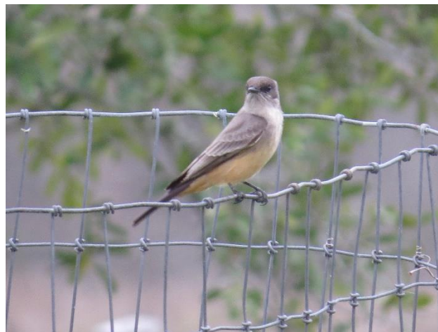
A SAY'S PHOEBE