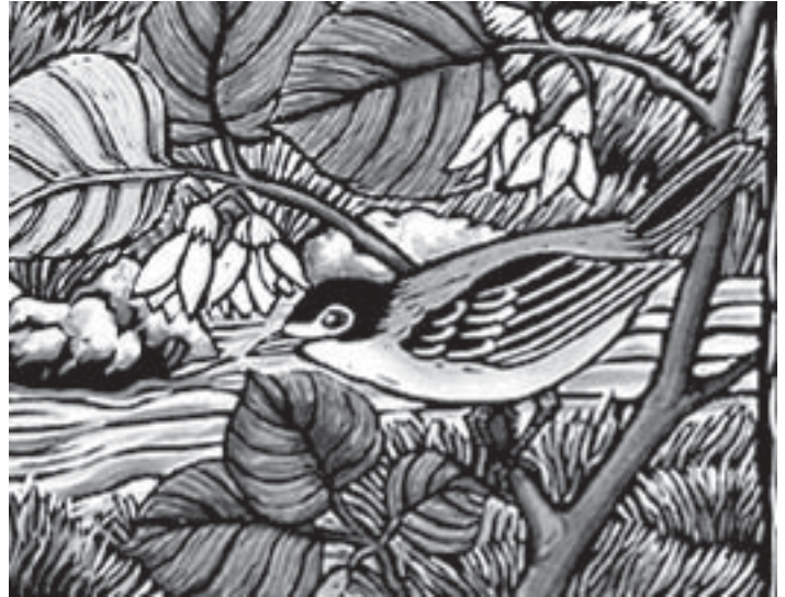
Black-capped Vireo

that can be found on the different trails as well as having a question and answer session about the Refuge after the presentation.