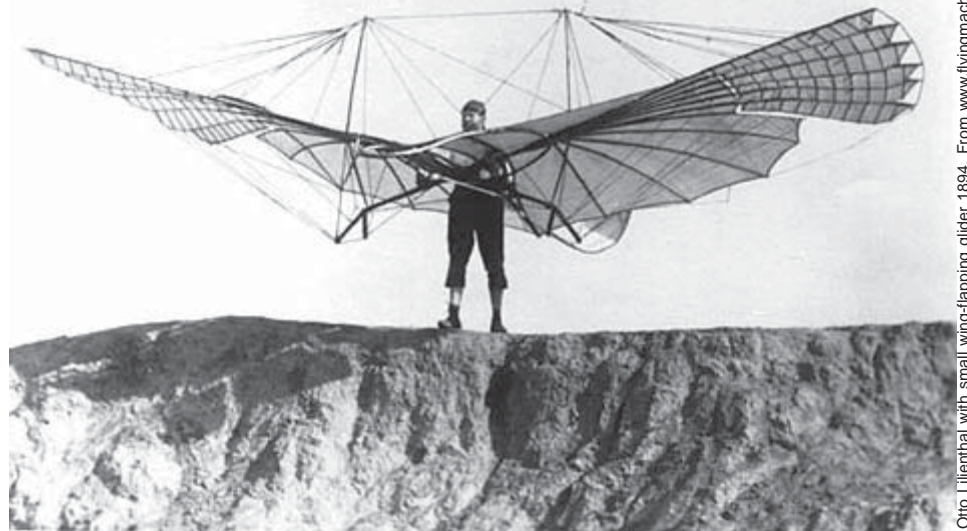
Otto Lilienthal with small wing-flapping glider 1894.

This presentation is a lighthearted, nontechnical look at some of the factors that allow birds to fly while we humans watch them from the ground. It discusses the requirements for flight, and the remarkable ways in which birds meet those requirements. The methods man uses to fly and those of the birds have some significant differences. We will also address some of the “burning questions” that everyone has had about flight, while trying to avoid a boring, equation-based, engineering discussion! Who hasn't asked questions like “Why can't I fly like the birds? Why don't birds crash? Why do birds fly in “V” formations? How do birds navigate thousands of miles? Why do hummingbirds hum? What's the biggest bird to fly? How can that fly land on the ceiling?” For the answers to these and all your long-standing questions on physics, aerodynamics, materials engineering, and other fun stuff, don't miss this discussion.