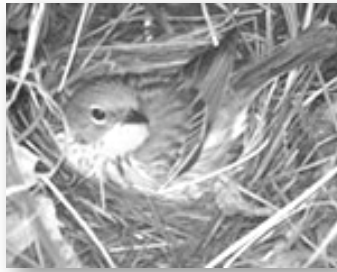
The Kirtland's Warbler has been restored to Protection.