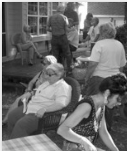
Party-Hearty: Gathered for a perfect October day under the pines.

Newsletter of the Bastrop County Audubon Society