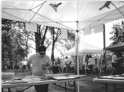
At Nature Fest: →

The six-mile trip to Tahitian Village take-out takes about two to three hours. From Bob Bryant Park launch to Fisherman's Park takes one hour.